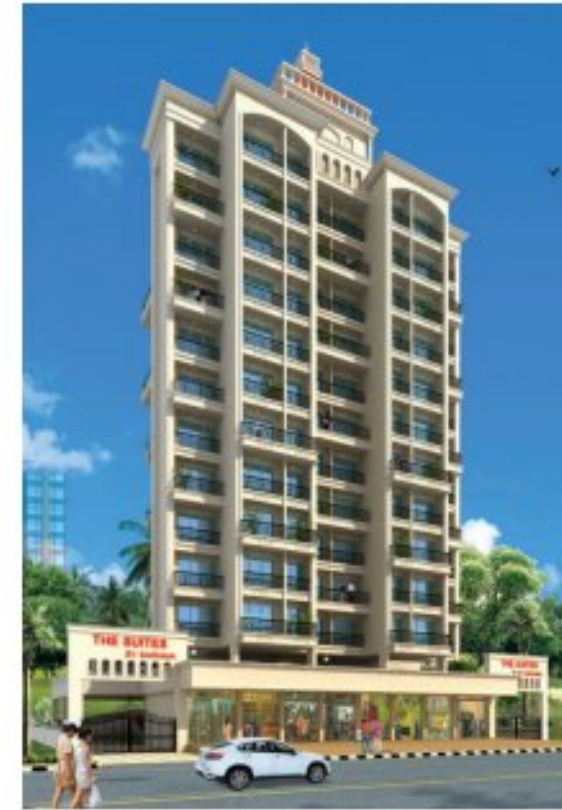
THE SUITES New Panvel, Navi Mumbai