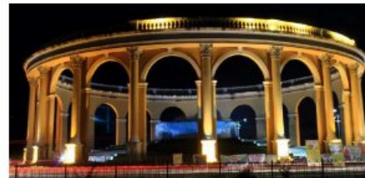
UTSAV CHOWK, KHARGHAR - NIGHT VIEW