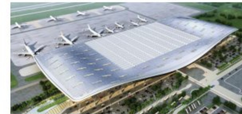
NAVI MUMBAI INTERNATIONAL AIRPORT