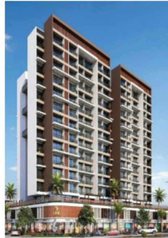
ONE WORLD New Panvel, Navi Mumbai