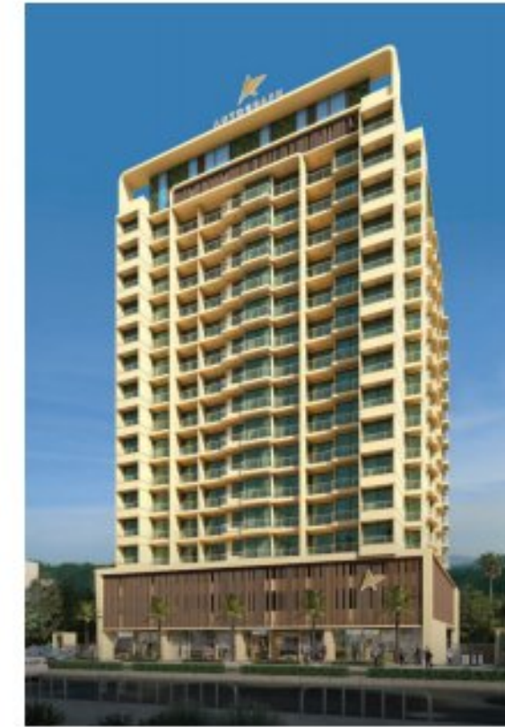
AUTOGRAPH New Panvel, Navi Mumbai