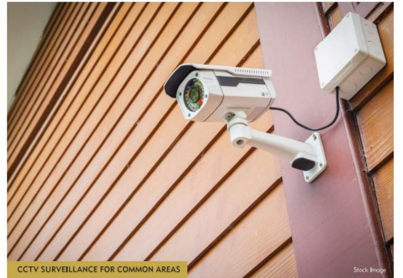
CCTV SURVEILLANCE FOR COMMON AREAS