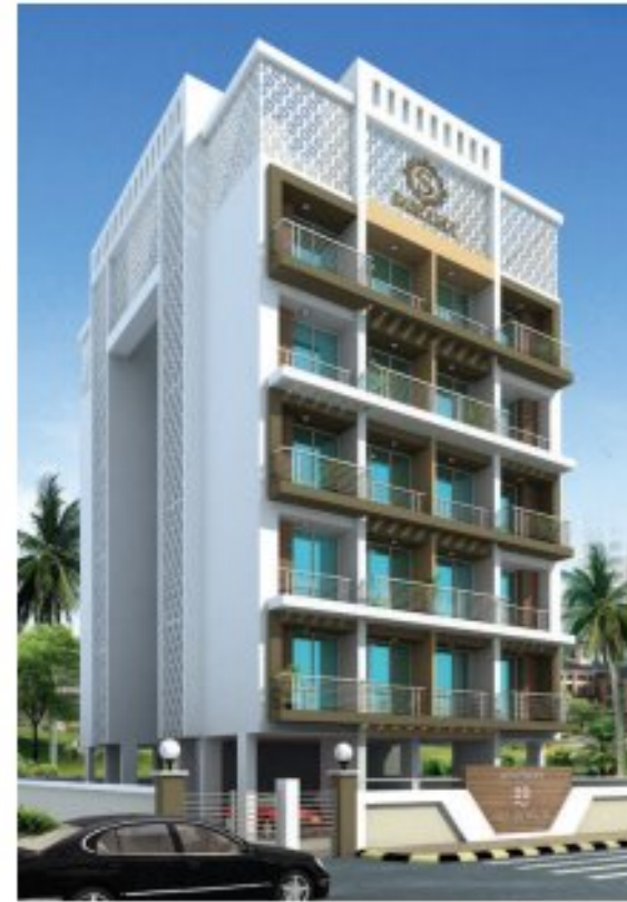
APARTMENT 20 New Panvel, Navi Mumbai