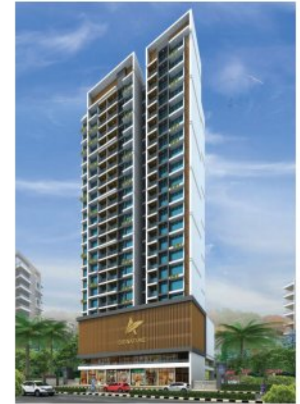
SIGNATURE Kharghar, Navi Mumbai