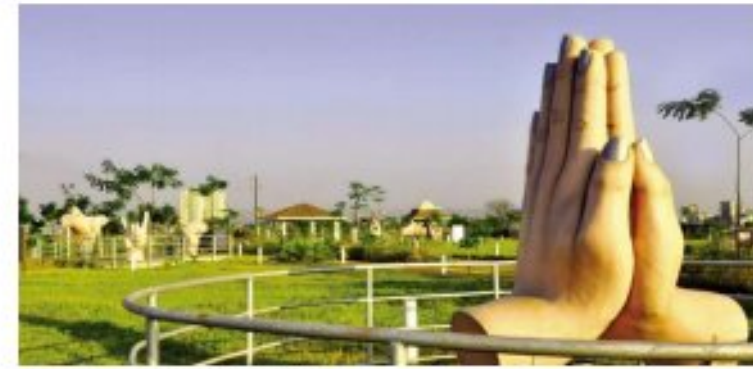
CENTRAL PARK, KHARGHAR

KHARGHAR IS THE GOLDEN NODE OF NAVI MUMBAI, A PLANNED MEGA CITY OFFERING A MARKEDLY SUPERIOR LIFESTYLE, BOUND BY EASY ACCESSIBILITY THROUGH HIGHWAYS AND SURROUNDED BY PICTURESQUE HILLS, IT IS WELL CONNECTED THROUGH VARIOUS MODES OF TRANSPORT TO ALL PARTS OF THE CITY. VARIOUS INFRASTRUCTURE PROJECTS PREDICT STEADY AND PHENOMENAL APPRECIATION AND GROWTH.