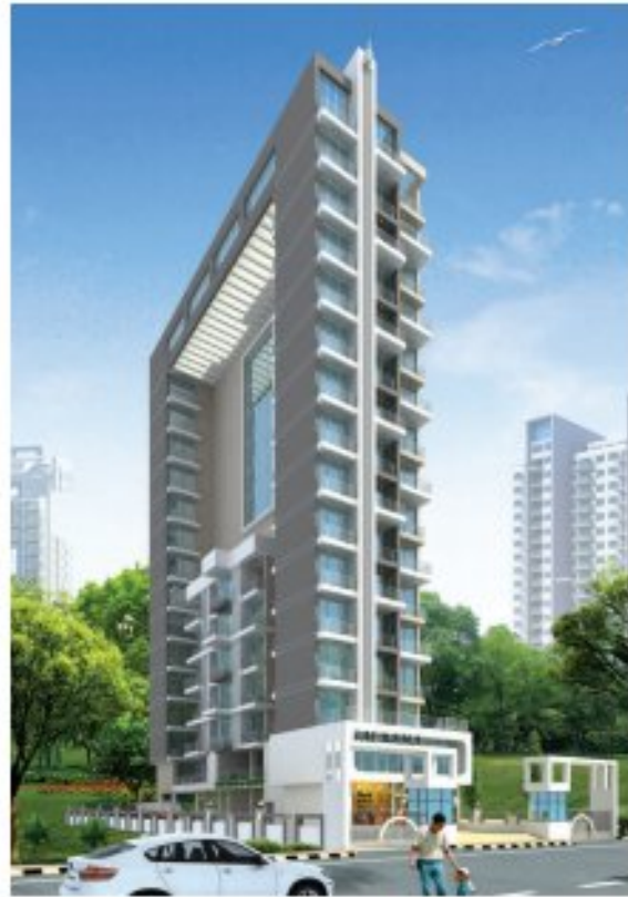
SAI RAMA Kharghar, Navi Mumbai