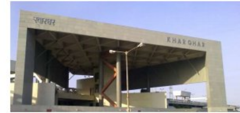
KHARGHAR RAILWAY STATION