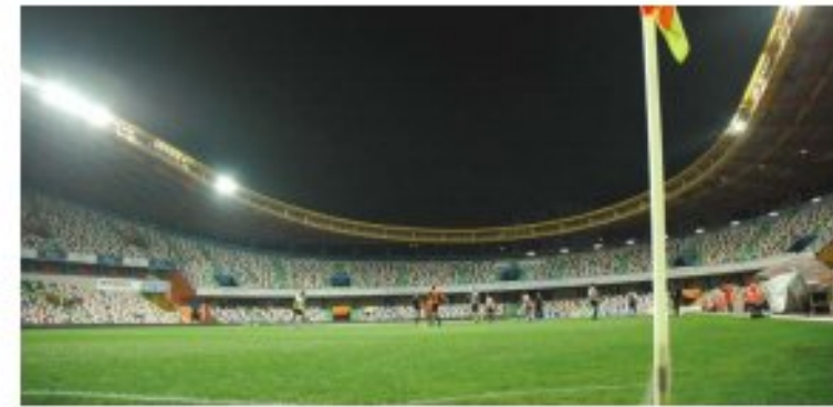
D.Y. PATIL STADIUM, NERUL