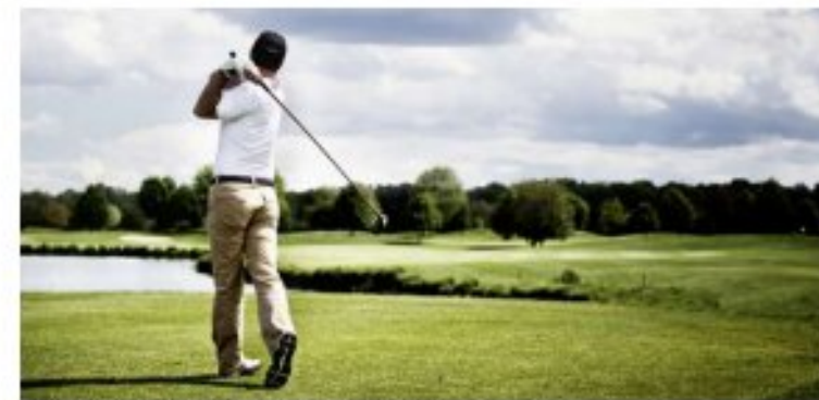
KHARGHAR VALLEY GOLF COURSE