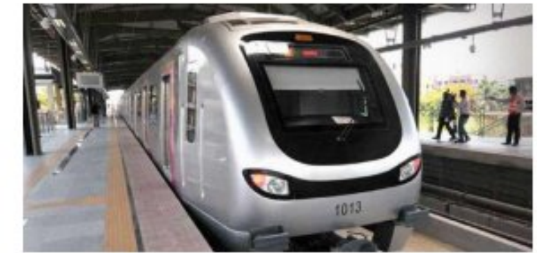
NAVI MUMBAI METRO RAIL